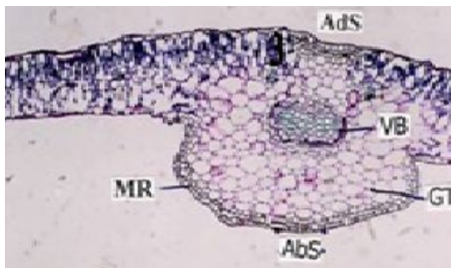
Figure 2: T.S. of leaves of Solanum indicum

of chemical compounds in a particular amount. Some compounds, i.e., coumarin and flavonoids, are studied for chemical components as well as for standardization of the plant materials. [25] The phytochemical screening of S. indicum confirms the presence of alkaloids, saponins, flavonoids, phenols, tannins, steroids, and terpenoids, which may be responsible substances for its pharmacology activities. TLC profiling of hydroethanolic extract has been carried out to achieve some chromatographic studies to confirm the presence of active components in S. indicum . [26] TLC profiling shows different spots with different R f values. The separation of phytochemicals in the TLC plate gives different R f values with different mobile phases. The difference in the R f values depends upon the polarity of the compound, so that the solvent system which analyzed appropriate is used for further isolation from the plant extract. [27,28] Phytochemical screening and TLC profile of crude extract can be very useful for developing the quality parameters. The S. indicum is one of the therapeutically important plants. Since long time, it has been used for the treatment of a variety of ailments, but the details of its quality attributes like pharmacognostic, phyto